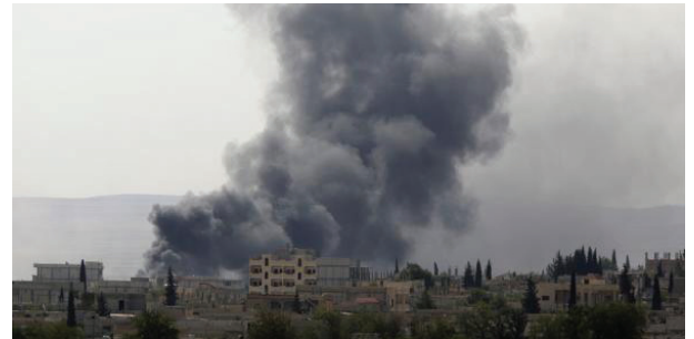
Smoke rises from the Syrian town of Kobani, seen from near the Mursitpinar border crossing on the Turkish-Syrian border in the southeastern town of Suruc, Sanliurfa province

According to The Washington Post, the villagers were members of the Shaitat tribe located in Abu Hamam in