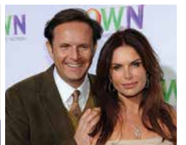
Mark Burnett and Roma Downey

Evangelist Franklin Graham, megachurch pastor Joel Osteen, and producers Mark Burnett and Roma Downey have topped Newsmax's list of the 100 most influential Christians in America.