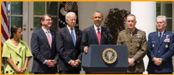
President Obama nominated Marine General Joseph Dunford to succeed Gen. Martin Dempsey as the next Joint Chiefs of Staff Chairman – the principal military advisor to the President and his national security team.

President Barack Obama delivers remarks announcing Gen. Joseph F. Dunford, Jr. as the nominee for Chairman of the Joint Chiefs of Staff and Gen. Paul J. Selva, far right, as the nominee for Vice Chairman of the